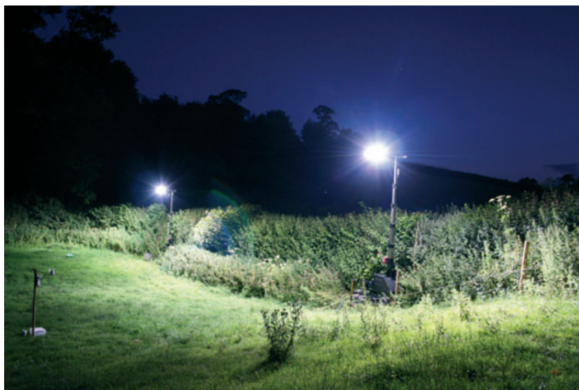
Fig. 1 Experimental LED lights along a hedgerow used as a commuting route by Rhinolophus hipposideros during the field study.

was performed on night six. The order of lit treatments on nights three to five was randomized between sites to control for order effects. The light level (lux) used during the high light intensity treatment was within the range of our previous experiments using HPS to enable direct comparisons between light types (Stone et al. , 2009). Illuminance (in lux) was measured using a T-10 illuminance metre (Konica Minolta Sensing Inc, Osaka, Japan) held horizontally 1.7 m high at the hedge below the lights. Mean hedgerow height across sites was 7.34 m (SD = 4.45 m) on the lit side and 7.55 m (SD = 4.91) on the unlit opposite side. Mean nightly temperature using a TinyTag TGP-1500 Datalogger (Gemini Dataloggers UK Ltd, Chichester, West Sussex, UK) was recorded at four sites only due to equipment failures at the remaining six sites. Mean daily rainfall (mm) and mean nightly temperature (degrees Celsius) for the remaining six sites were obtained from the Met Office ( http://www.metoffice.gov.uk ) from the weather station closest to each site (mean distance 17.5 km, SD = 15.5 km).