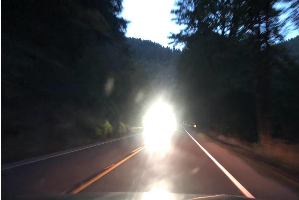
Figure 2 - LED Headlights

LEDs are not “energy efficient” as claimed by the LED lighting industry. To be energy efficient, a technology must provide the same quality of service and perform the same task as the previous technology. The task in this situation is to provide uniform illumination without harm. Since LED radiation does not provide uniform illumination, and since the LED radiation is sending people to the hospital, causing eye damage, and violating civil rights, LED radiation is not energy efficient and therefore should not be used for the purpose of illumination. The claim of “energy efficiency” by the LED lighting industry is fraudulent.