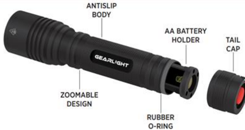
Figure 3 - LED Flashlight

WARNING: To avoid eye injury, do not stare directly into the light beam or shine the beam directly into anyone's eyes. This product is not designed, intended, or recommended for children or hazardous environments.