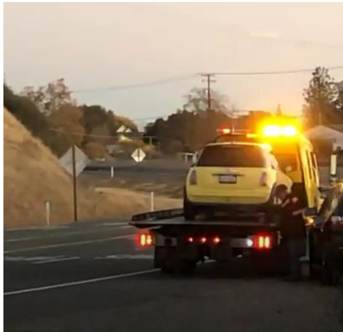
Figure 2 - Flashing LED Lights on Tow Truck

Figure 2 shows the blinding LED flashing light on a tow truck. The video shows the rapid flashing of high-intensity visible radiation, creating a dangerous condition. ( https://youtu.be/cJKgMtXJ-IE ) These LED flashing lights are unregulated by the government.