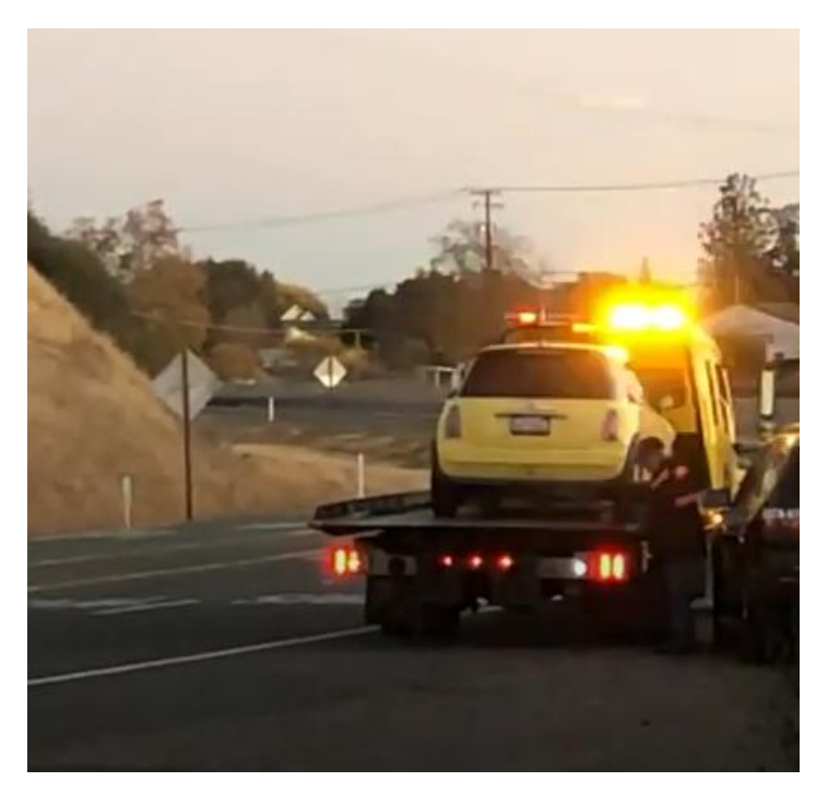
Figure 2 - Flashing LED Lights on Tow Truck

Figure 2 shows the blinding LED flashing light on a tow truck. The video shows the rapid flashing of high-intensity visible radiation, creating a dangerous condition. (<a href="https://youtu.be/cJKgMtXJ-IE">https://youtu.be/cJKgMtXJ-IE</a>) These LED flashing lights are unregulated by the government.