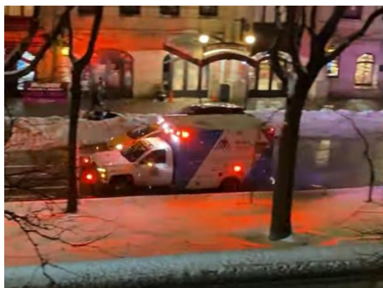
Figure 2 - New York City Ambulances

Ambulances: https://youtu.be/amoR1QSiBHw