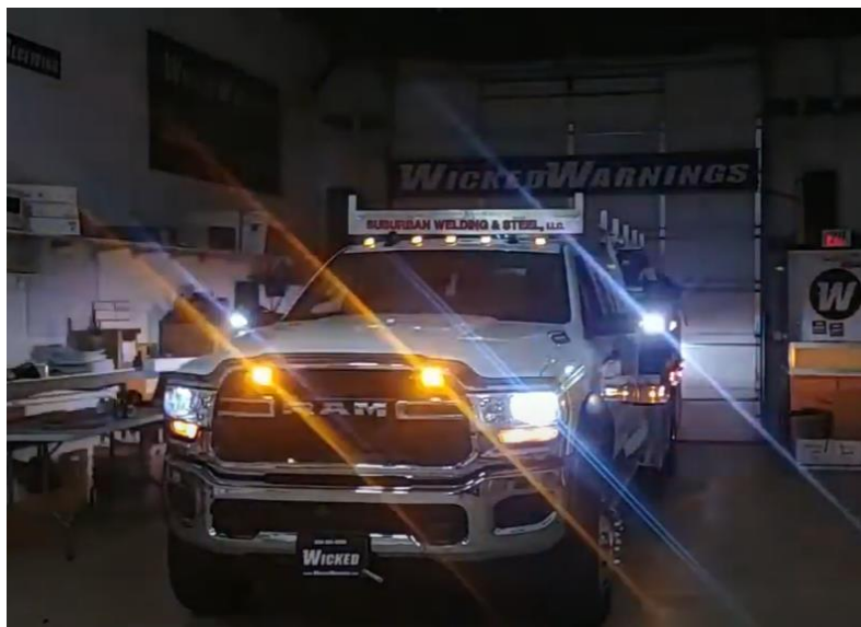
Figure 1 - Utility Truck

Utility Truck: https://youtu.be/0MLDA6too1Q