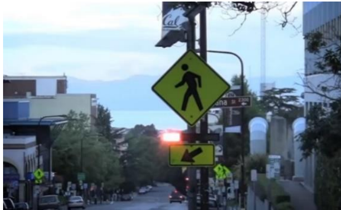
Figure 3 - RRFB

Rectangular Rapid Flashing Beacon: https://youtu.be/KBltx0Argag