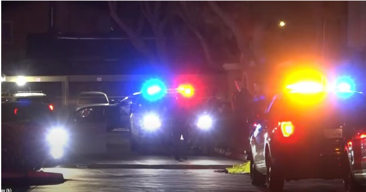
Figure 6 - Police Flashing Lights

Police LED Flashing Lights: https://youtu.be/k3FvFwsW-vs