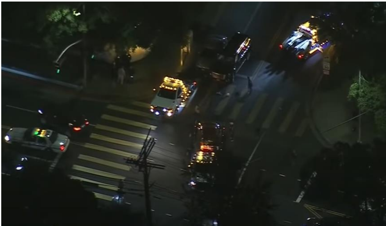
Figure 1 – Arnold Schwarzenegger Accident

Emergency Vehicles with LED Flashing Lights: https://youtu.be/R6wjQSHUpuU