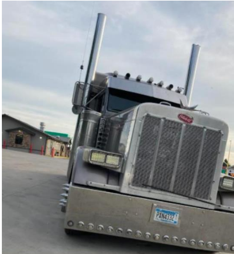
Figure 2 - Illegal Aftermarket LED Headlights

Figure 2 shows an older model truck with aftermarket LED replacement headlights. We know that the headlights are LED because we can see the diodes in the photo.