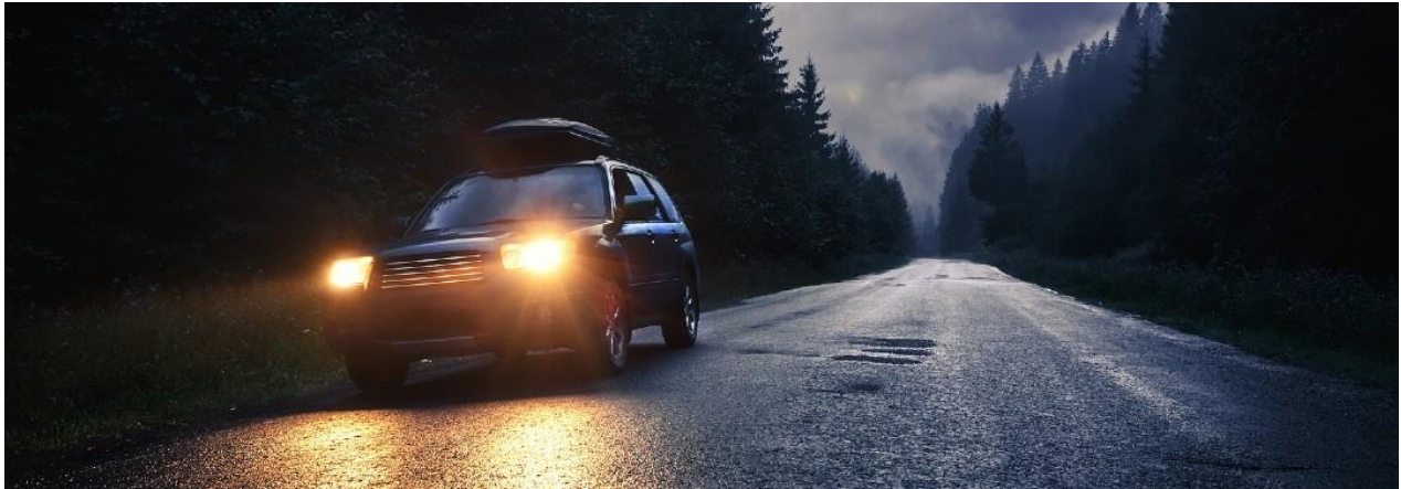
Figure 2 - Tungsten Filament Headlights 1

Figure 2 is a photo of tungsten filament headlights. The photo shows the yellowish color and low glare of the tungsten headlights providing essentially uniform illumination.