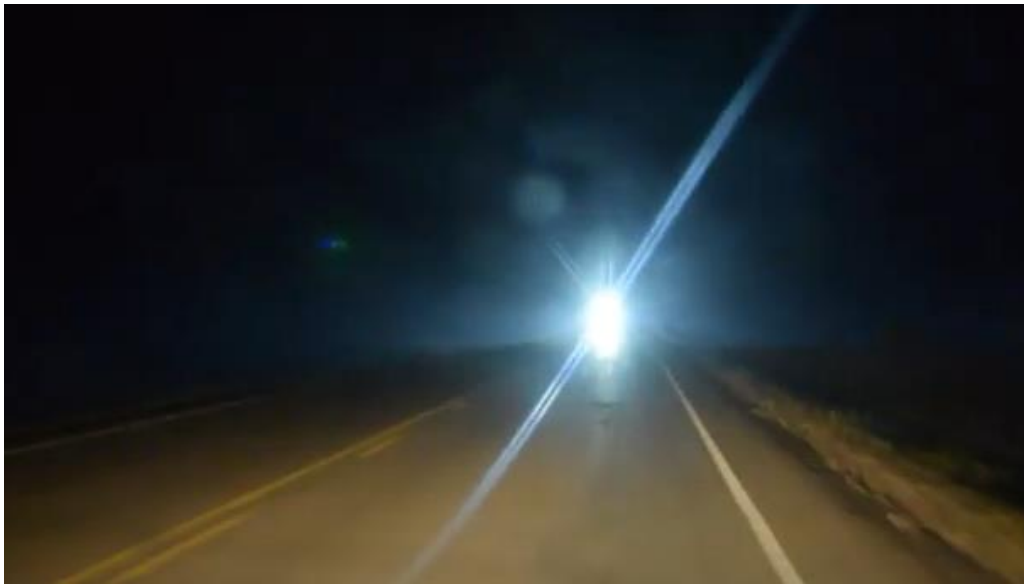
Figure 3 - LED Headlight Glare

Figure 3 is an example of the glare from a surface source LED headlight. Here is a link to a video showing the oncoming glare from different vehicles. Video: https://youtu.be/sQHpkG7UhA