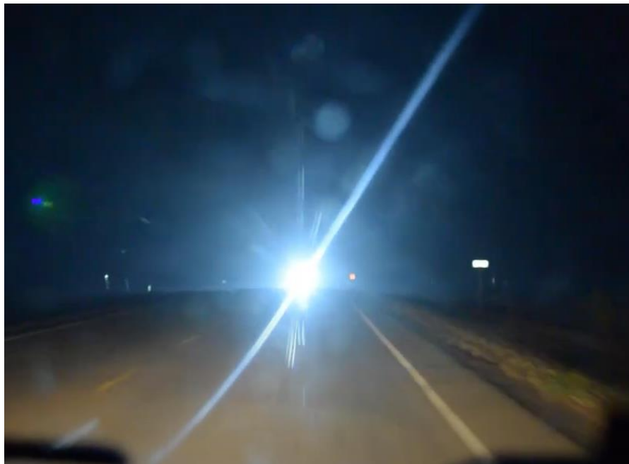
Figure 1 - LED Headlights

The blinding glare from LED headlights is exceedingly dangerous.