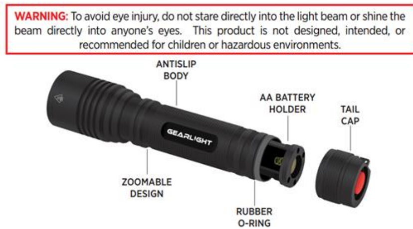
Figure 2 - LED Flashlight

As an example of how dangerous LED radiation is, consider this warning shown in Figure 2 from the company Gear Light.