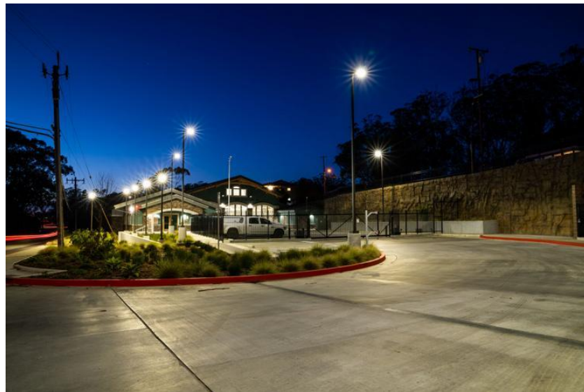
Figure 2 – El Granada Fire Station

We wish to alert San Mateo County to liability issues related to the installation and operation of LED radiation devices. Figure 2 shows LED radiation devices at the El Granada Fire Station that are subjecting persons in the area to toxic, hazardous, and discriminatory radiation.