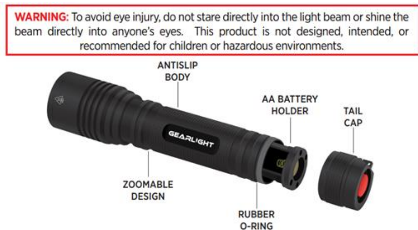
Figure 3 - LED Flashlight

As an example of how dangerous LED radiation is, consider this warning shown in Figure 3 from the company Gear Light.