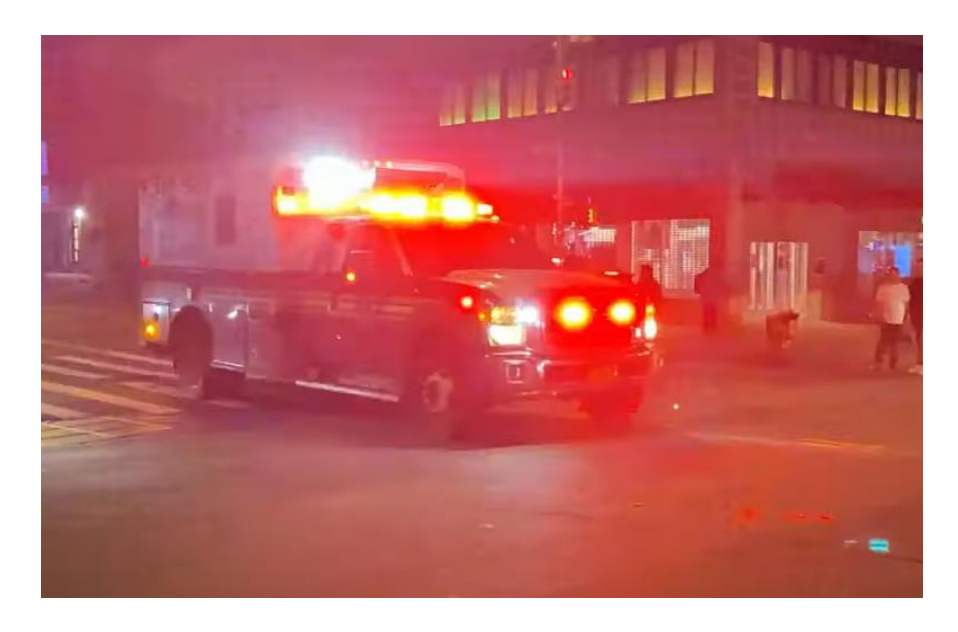
Figure 2 - Flashing Lights on Ambulance