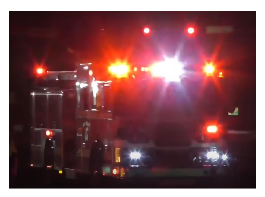
Figure 1 - LED Flashing Lights and Sirens on Fire Trucks

2. Fire Trucks – This video shows the use of intense LED flashing lights and excessively loud sirens on fire trucks. <a href="https://youtu.be/r8VdWLIAzr0">https://youtu.be/r8VdWLIAzr0</a>