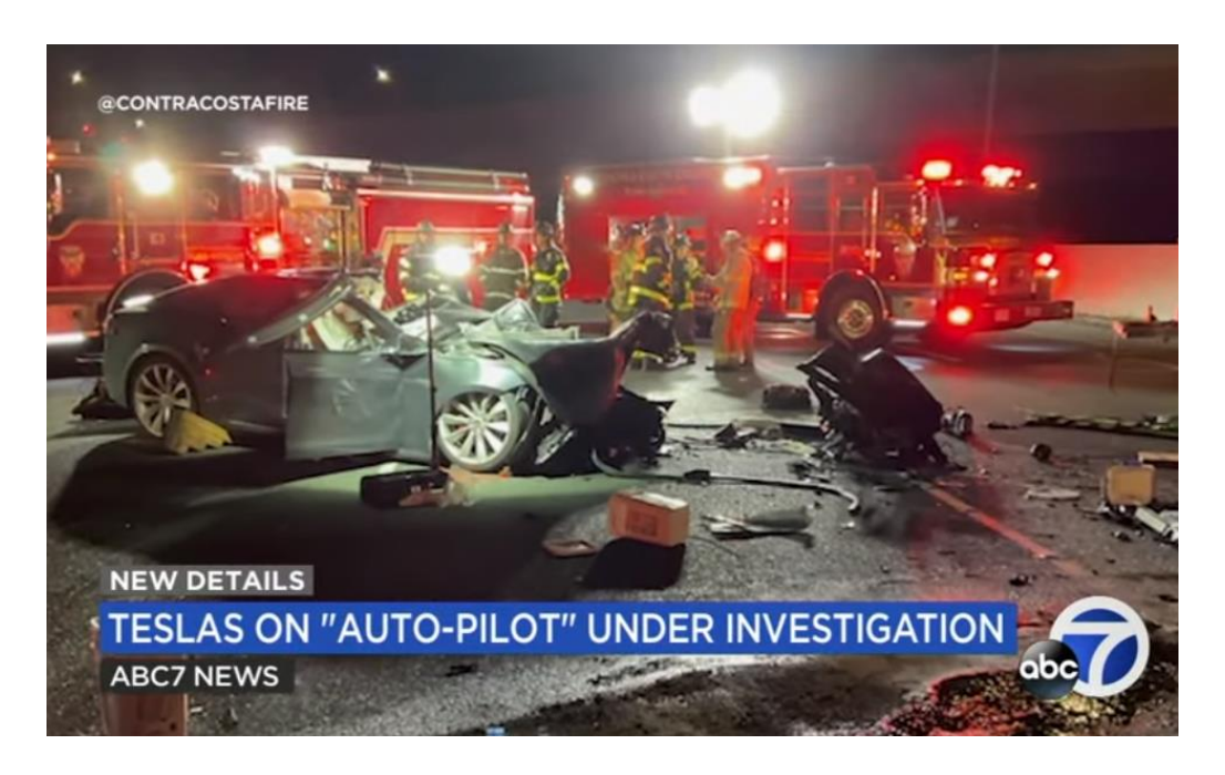
Figure 6 - Tesla Autopilot Crash<sup>25</sup>

In another San Francisco incident, a Cruise vehicle crashed into a fire truck on August 17, 2023.<sup>22</sup> In February 2023, a Tesla on autopilot crashed into a fire truck, killing the driver.<sup>23</sup> On February 27, 2021, a Tesla on autopilot crashed into a police vehicle.<sup>24</sup>