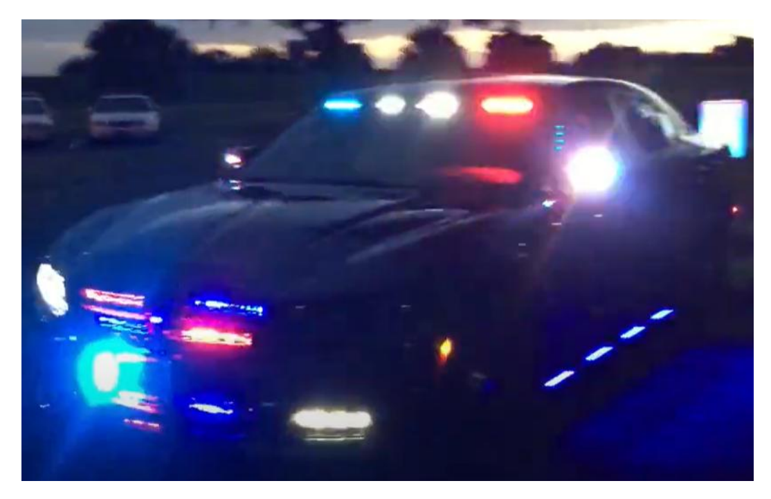
Figure 4 - <a href="https://youtu.be/KJ">https://youtu.be/KJ</a> 1CiNVtTo