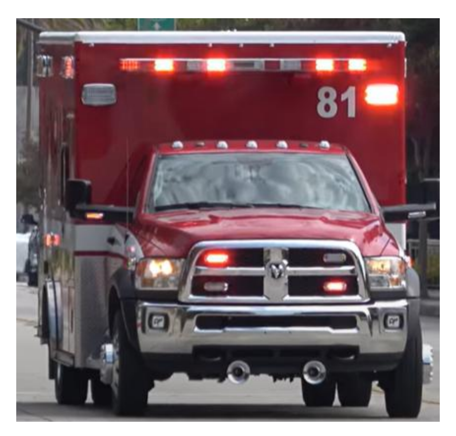
Figure 6 - https://youtu.be/03hdXzTcjYI