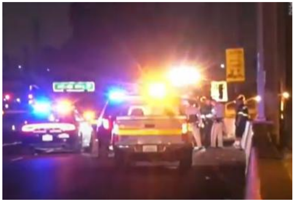
Figure 1 - Auxiliary LED Flashing Lights

California Vehicle Code ("CVC") § 25250 states, "Flashing lights are prohibited on vehicles except as otherwise permitted."