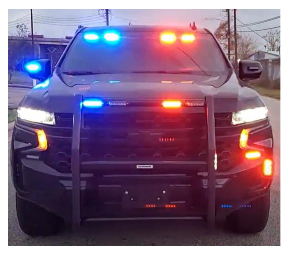
Figure 5 - https://youtu.be/Rr5s987dFGk