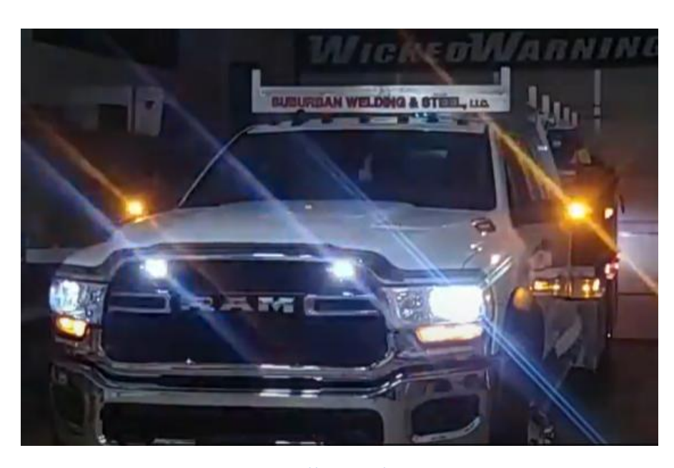
Figure 3 - https://youtu.be/0MLDA6too1Q